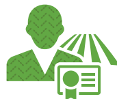
By licensed professional applicators