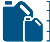
Suitable, easy-to-handle container size