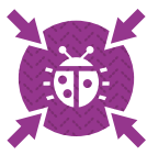
Integrated Pest Management