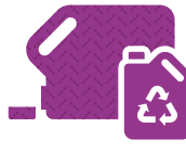
Proper disposal of empty product containers