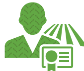
By licensed professional applicators