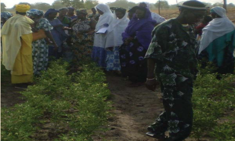
Participants visiting a plot of tomato plants for pests and diseases diagnosis.

Une formation de 3 jours conduite par Mamadou Badiane a regroupé 134 participants dont 98 femmes dans la région de Kolda, Sénégal, sur le diagnostic et la gestion des ravageurs et maladies de la tomate.