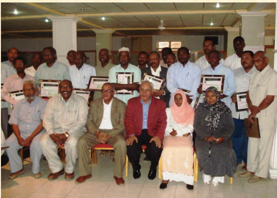
21 master trainers certified in Sudan

La couverture médiatique par la presse locale a abouti à plusieurs reportages sur les chaînes de radio et TV.