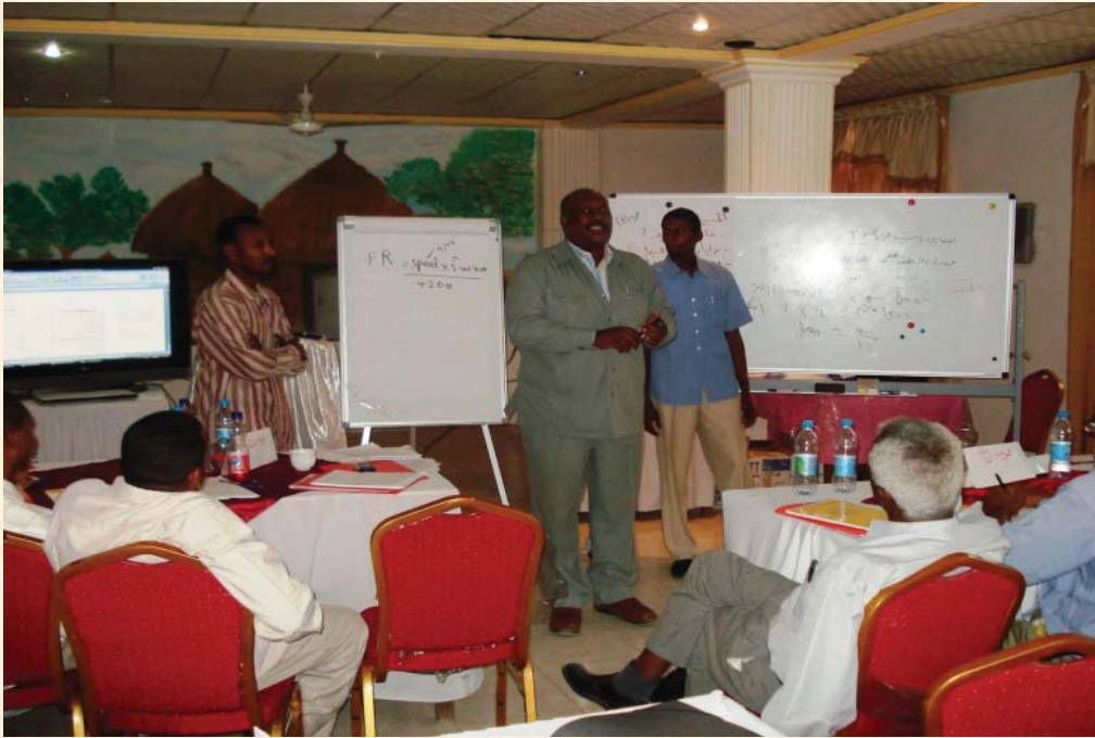
ToT session in Gadarif City

The Sudan Agrochemicals Association (SAGA) and CropLife Africa Middle East organised a master trainer course for the rain fed agricultural sector which took place at Almotawakil Hotel in the city of Gadarif in Sudan from 21-25 December 2008.