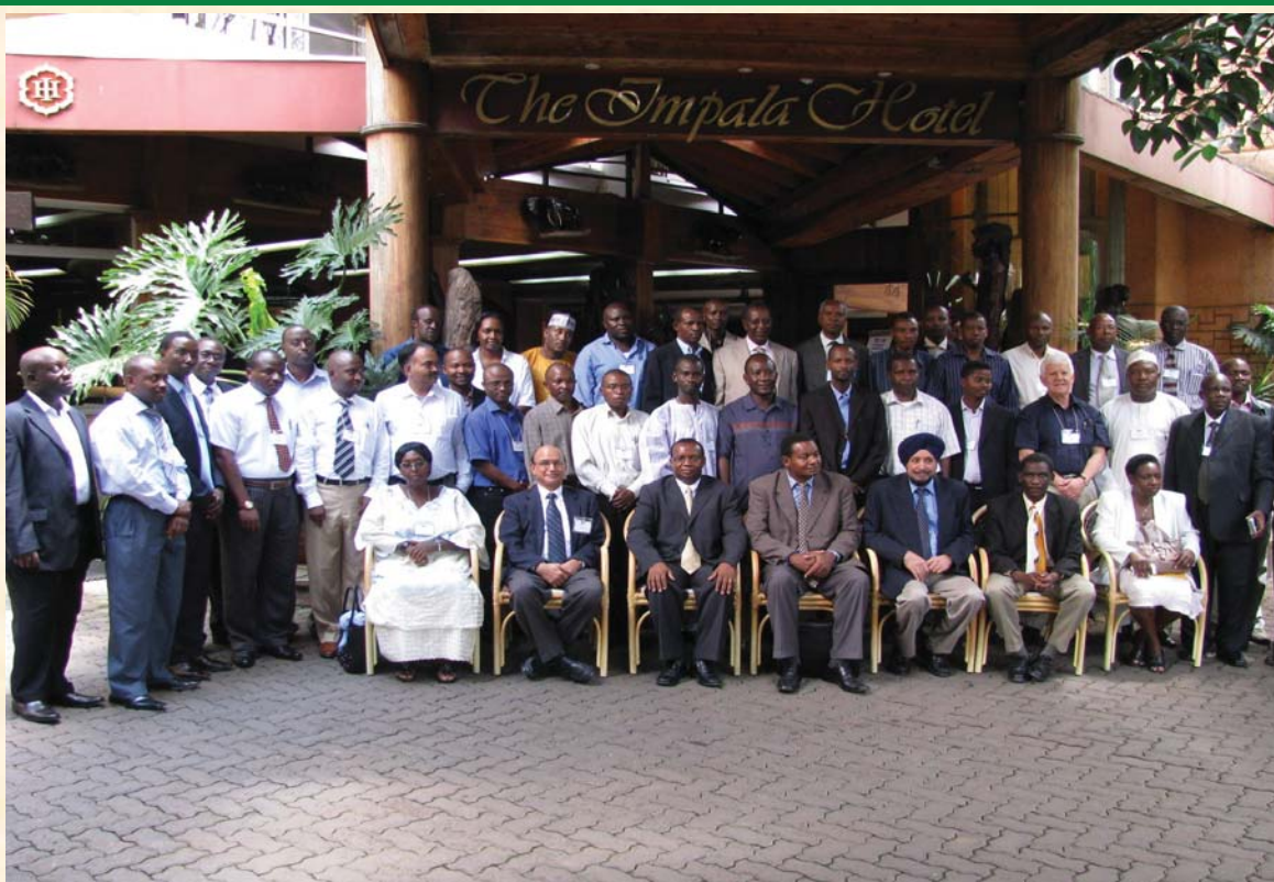
Group photo at Agro-Input Dealer Workshop

The International Workshop on “Agro Input Dealers Development in Africa” took place on 8—12 December 2008 in Arusha, Tanzania. The workshop was hosted by IFDC and sponsored by the East African Community (EAC)