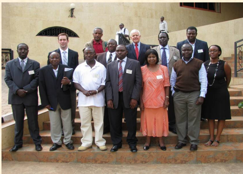
The Africa Regional Team together with valued participants