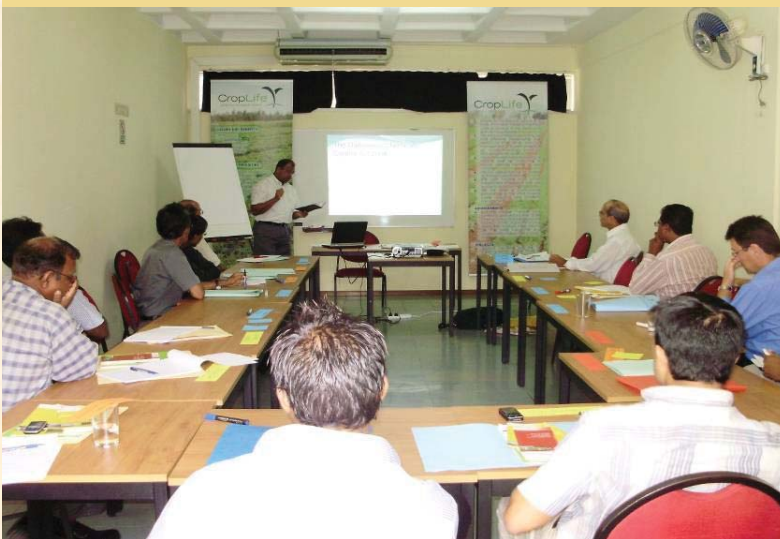
The CropLife Mauritius Team at work

These presentations were followed by two sessions, one of which dealt with the framework for a fully-fledged container management project in Mauritius. The last session was devoted to 'The way forward – member commitment and resolutions.'