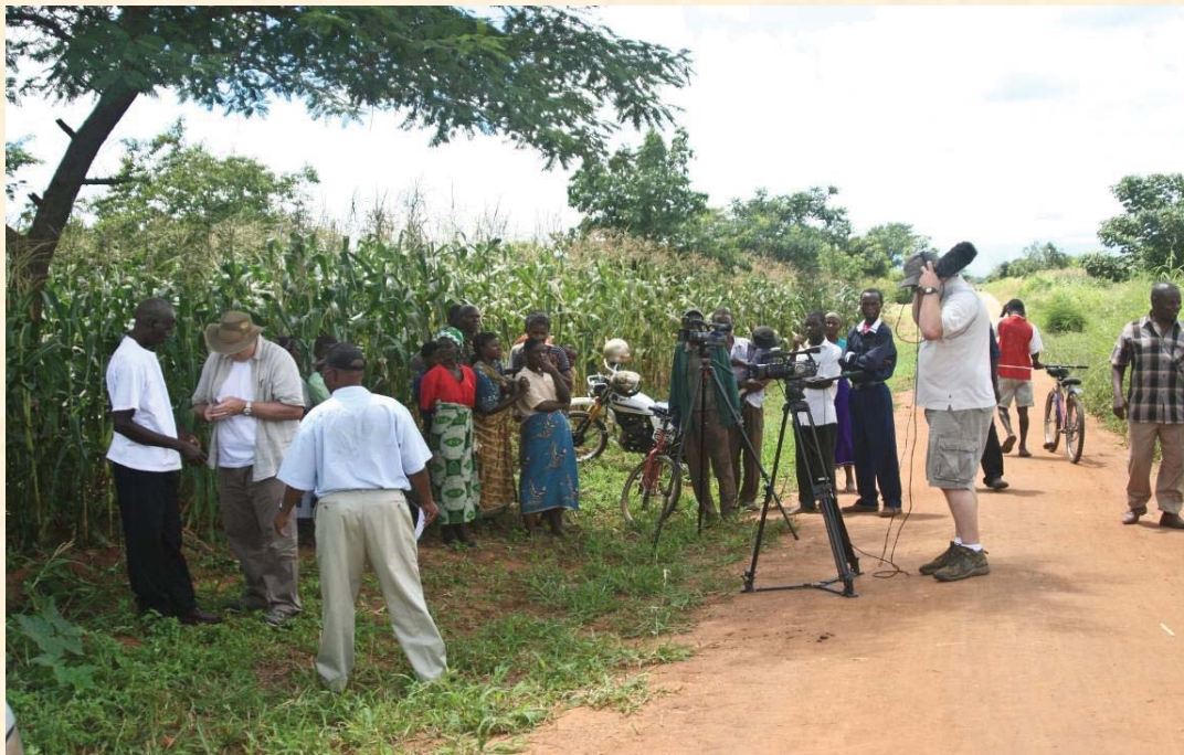
The filming and interviewing process in Malawi