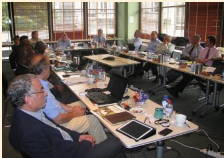
General Assembly & Board Meeting