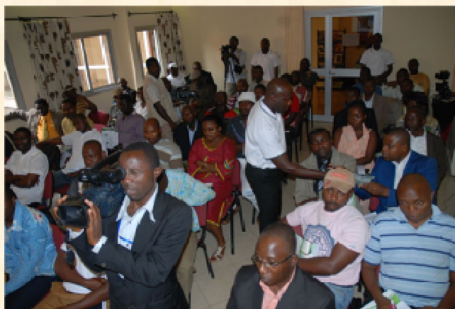
Media (Above) attended the meetings together with farmers and officials (Below) and made a large coverage on the issue to sensitize the population.