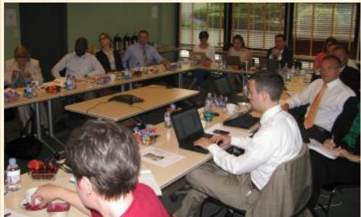
Communication Steering Committee

A side meeting took place between the regional coordinators of CropLife Africa Middle East and the communications team of CropLife America and CropLife Canada. The meeting focused on the potential utilization of social media networks in driving communication activities and creation of online communities. An electronic aid was provided to allow for further investigation and initiation of access to the social media.