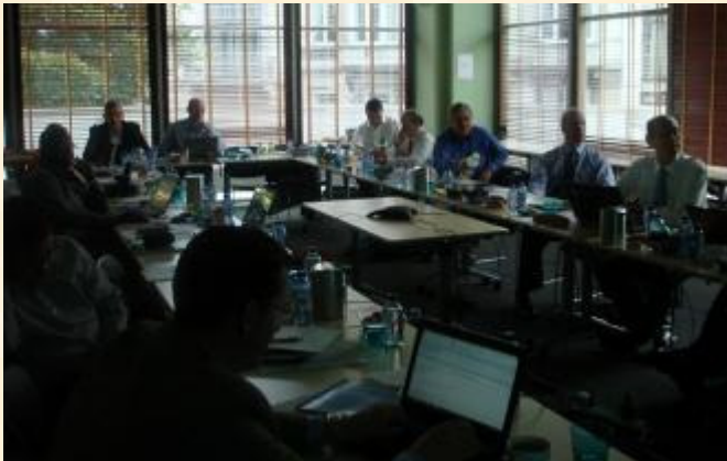
Anti-Counterfeiting Steering Committee