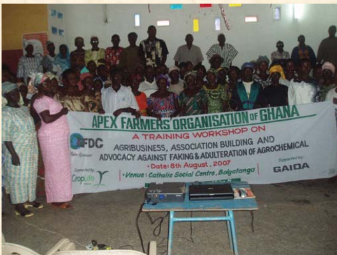
Group picture of Small-scale Farmers

These participants will now disseminate the knowledge acquired to members of their own various associations, and the team will set up similar training programs in other parts of the country to benefit all farmers. CropLife Ghana will conduct a follow-up activity in late October and early November to check on the activities of the dealers and farmers in some communities.