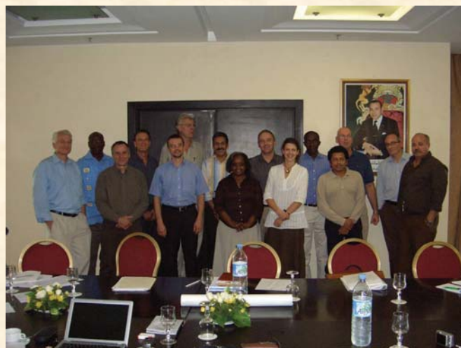
Delegates at the 2nd ASP Stakeholder Forum, which was held in Rabat, Morocco