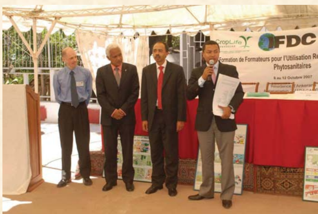
Rivo officiates at the certificate ceremony

CropLife Madagascar and IFDC will initiate a project in cooperation with the Ministry of Agriculture, to promote capacity building on fertilizers and pesticides. Cooperation between CropLife Madagascar and the Ministry of Agriculture will continue with the re-launch of the pesticides training program on national radio. See our website for more details and more pictures: www.croplifeafrica.org or contact les.hillowitz@icon.co.za