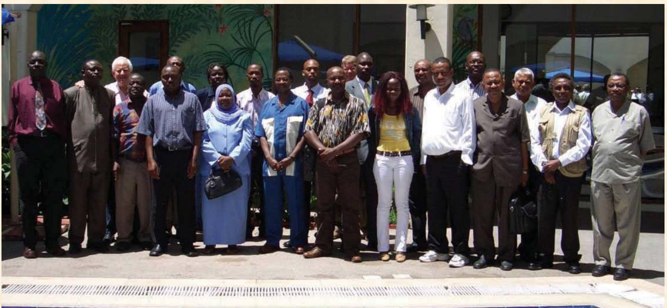
The group that participated in the Container Management Workshop in Dar-es-Salaam