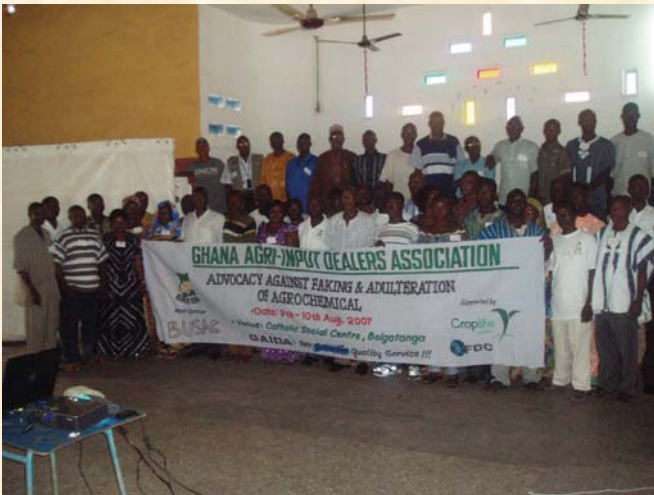
Group picture of Input Dealers

The second session was held at the Catholic Social Centre, in Bolgatanga, UER (below).