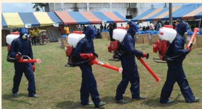
Local administrative, political and traditional authorities (Right) attended the ceremony for the distribution of mistblowers and PPE to SSP's (Left)