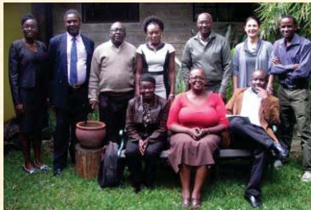
Participants at the GAP Analysis workshop