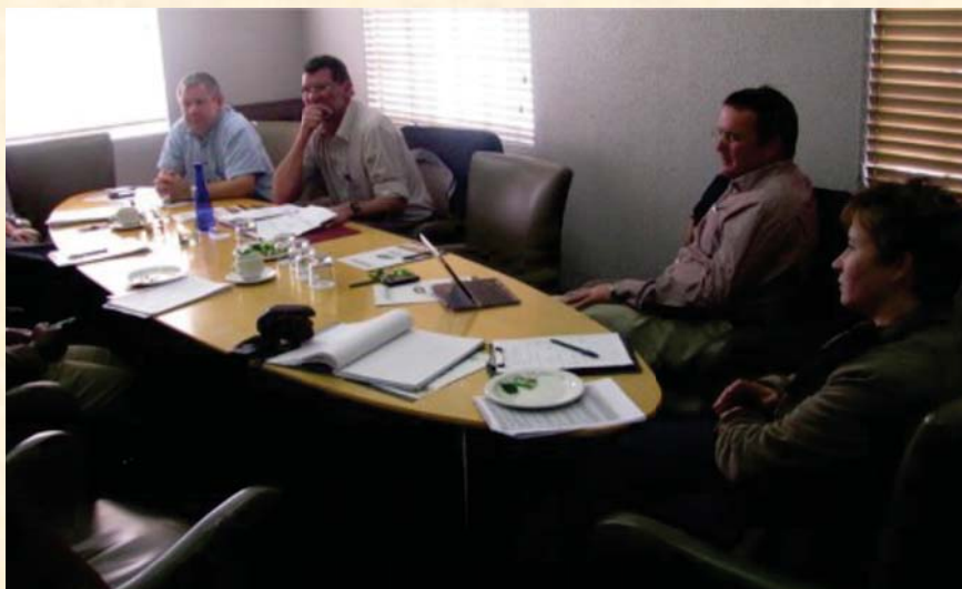
Members of the Pollinator Forum