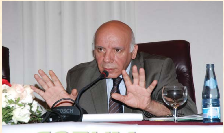
HE Dr. Rachid Benaissa, Minister of Agriculture and Rural Development of Algeria.

Other industry speakers highlighted the ongoing developments on EU pesticide regulations and their impact on the region. The presence and participation of CropLife Africa Middle East was well received by the forum organizers and audience. Parallel meetings were held by the Executive President and the Regional Coordinator with local industry representatives which resulted in the formation of an interim committee aimed at the legal incorporation of a local industry association, CropLife Algeria