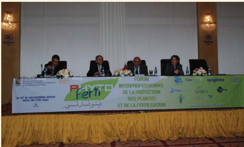
Phyto Ferti Forum