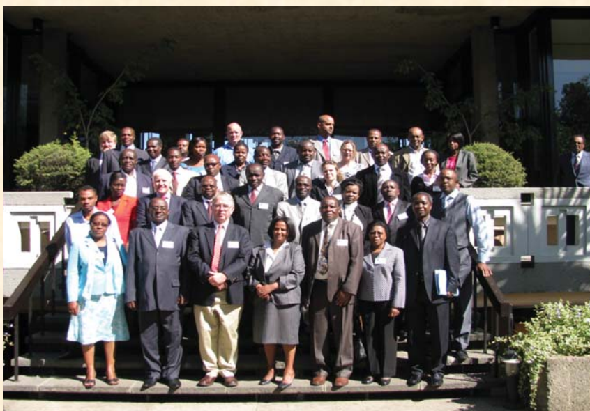
Participants at the Meeting

The main goal of ACTESA is to increase farmer productivity and incomes in the COMESA region through trade in staple crops. This, in a region where 90% of all staple crop producers are smallholder farmers and of these only about 10% produce for the market and are characterized by poor organization with no predictable selling mechanisms.