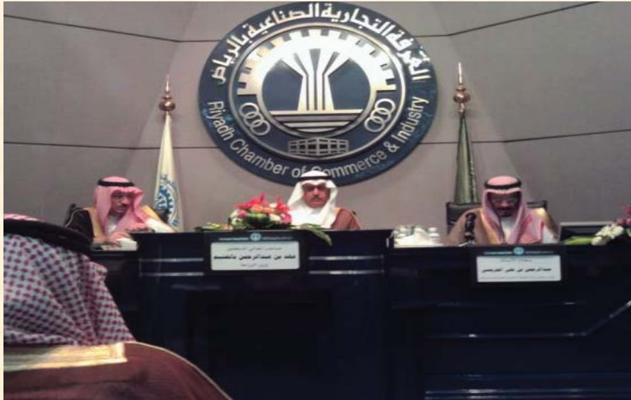
Workshop at Riyadh Chamber of Commerce

The Riyadh Chamber of Commerce in cooperation with industry representatives conducted a full day workshop on 31 October 2009 on the "Safe Use of Pesticides" under the patronage of his Excellency the Saudi Minister of Agriculture.