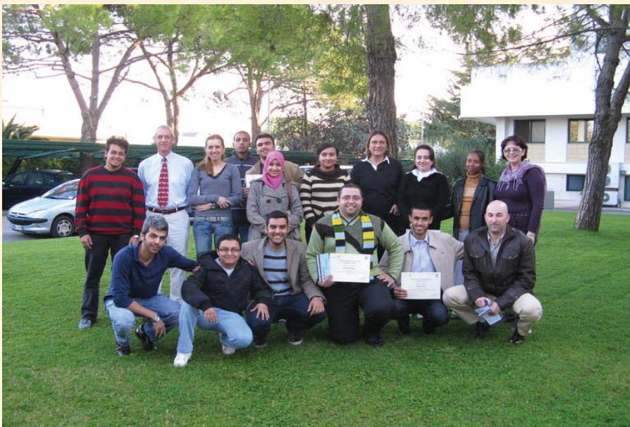
Participants at the IPM course

The course was held in the context of the ongoing cooperation between MAIB and CropLife Africa Middle East.