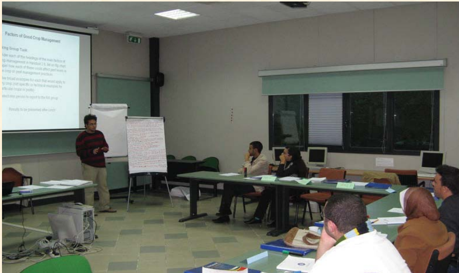
The IPM course in session

CropLife Africa Middle East conducted an IPM course at the Mediterranean Agronomic Institute of Bari (MAIB) in Bari, Italy between 7-14th of November 2009.