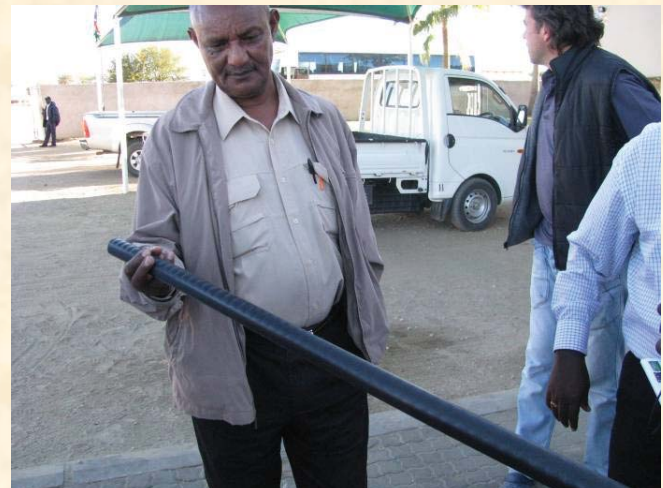
The end product—Fencing Posts