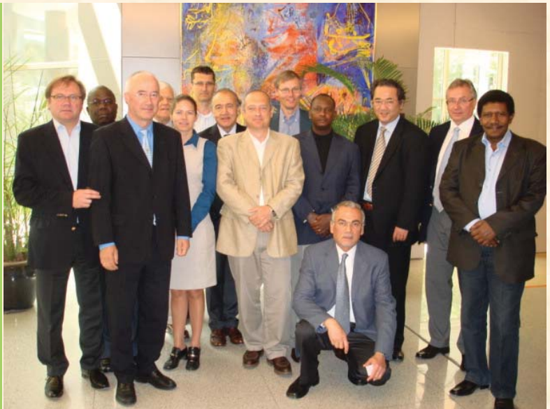
Participants of General Assembly and Executive Committee