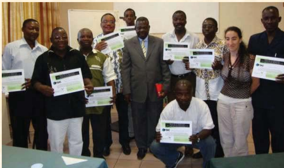
Participants received their certificates from the Director of Agriculture of MoA Togo (middle)

During the training, a specific exercise on IPM/ RU was undertaken and evaluated by the other participants on the course. All participants received a certificate of competence.