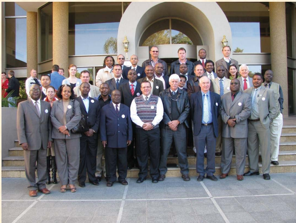
Delegates at the conference