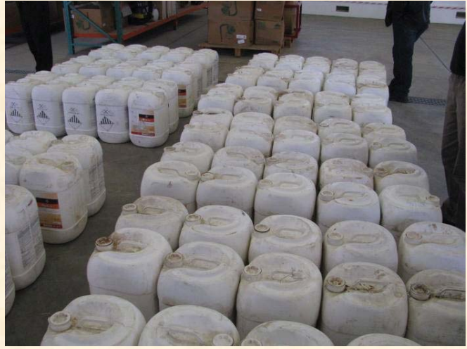
Empty containers sorted at the collection point

On the afternoon of the third day the group had the opportunity to see firsthand container management in Namibia. This included: