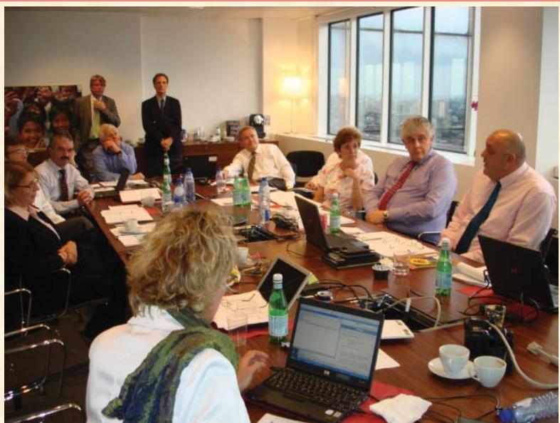
Stewardship Steering Committee Meeting—June 2009