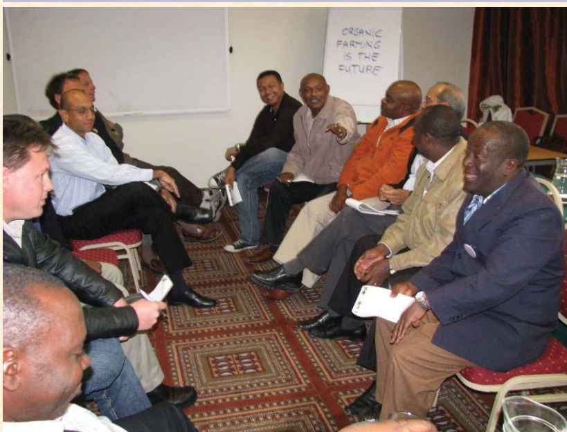
The Group in serious debate