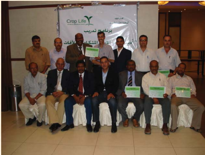
Master Trainers certified in North Africa Middle East

CropLife Africa Middle East organized the 3rd launch of the CropLife International IPM course in Amman between 14 – 18 June 2009.