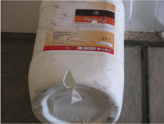
An example of a container punctured