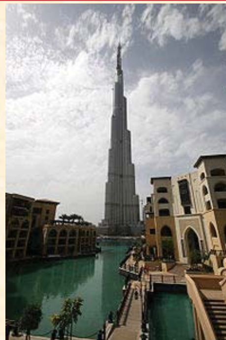
The Buij Dubai—tallest man made structure in the world

Also highlighted were projects designed to promote stewardship, IPM, IPR and related regional training programmes, while maintaining effective communications with stakeholders across the region. Local press provided timely coverage of the conference and its outcomes.