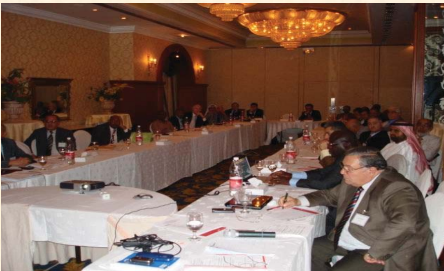
Industry Hub Association Workshop

La presse locale a largement couvert l'atelier.