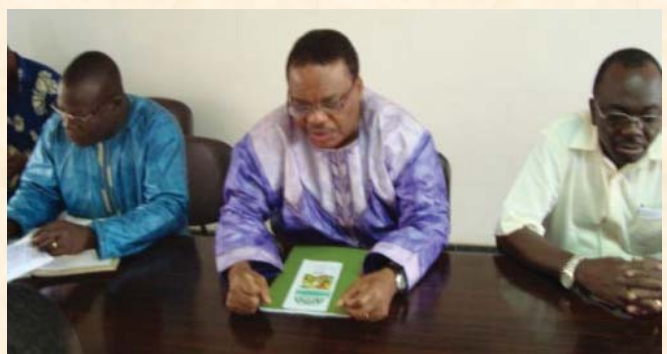
The executives of AFITO, Togo