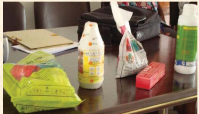
Quality CPP's used in the demonstration