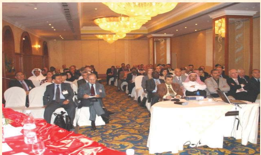
Conference combined session — Industry and government delegates