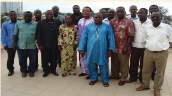
Participants at the training

IPM/RU au Togo: un atelier de formation s'est tenu les 15-17 Octobre à Lomé, Togo pour le renforcement des capacités pour 11 membres du Réseau National des Organisations Paysannes (RENOP). Les thèmes enseignés portaient sur les notions de base sur les pesticides, le choix correct des produits et des appareils d'application pour assurer la sécurité des utilisateurs et des consommateurs, la protection de l'environnement, la contrefaçon et le commerce illicite des pesticides.