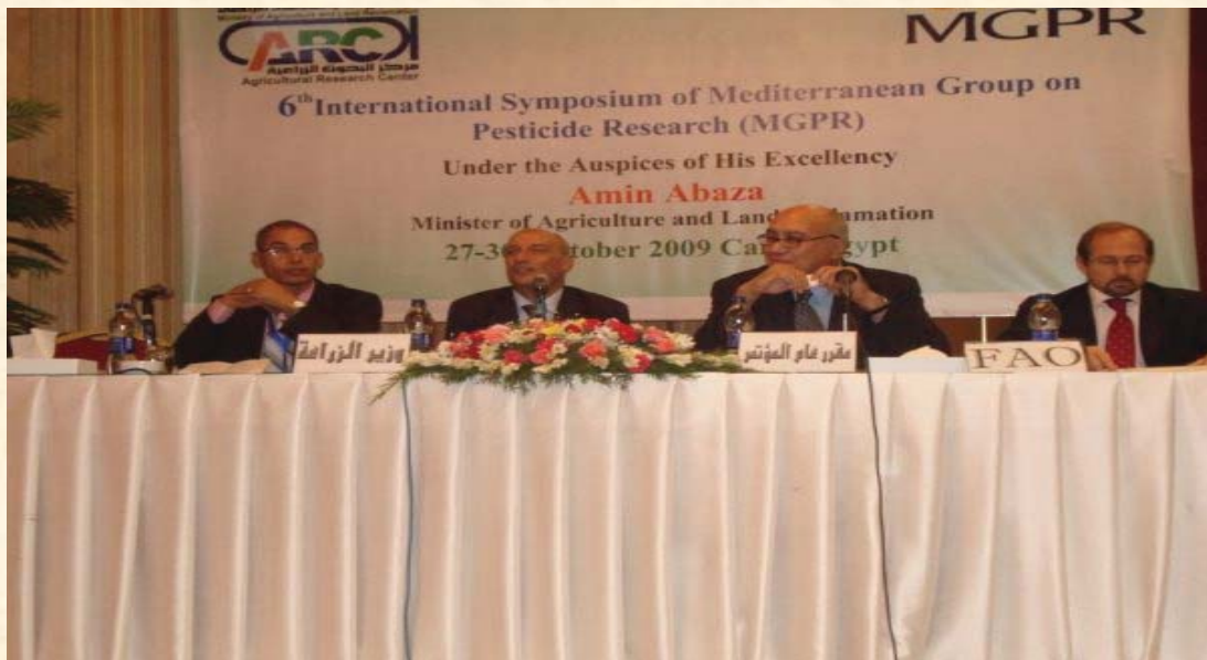
MGPR Symposium in Cairo

The demonstration on the use of the e-learning tool was well received and resulted in requests for over 300 copies for distribution among different stakeholders.