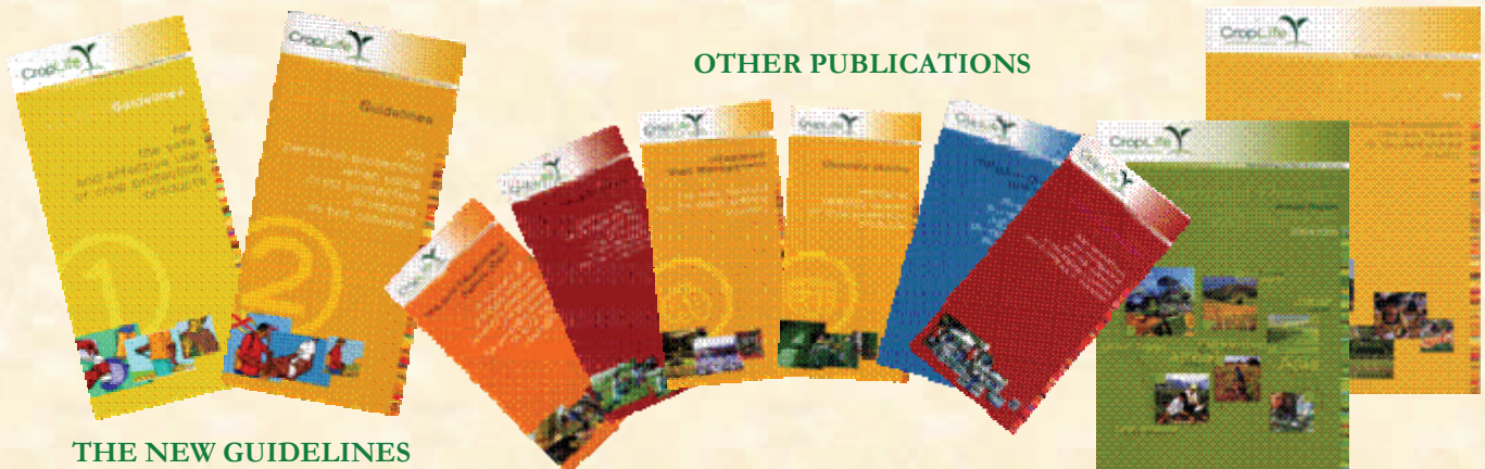
THE NEW GUIDELINES

These, and many other publications on various Crop Protection issues, can be downloaded from the CropLife International internet site at: ( www.croplife.org ) or they can be ordered by faxing CropLife International (+32-2-5420419).